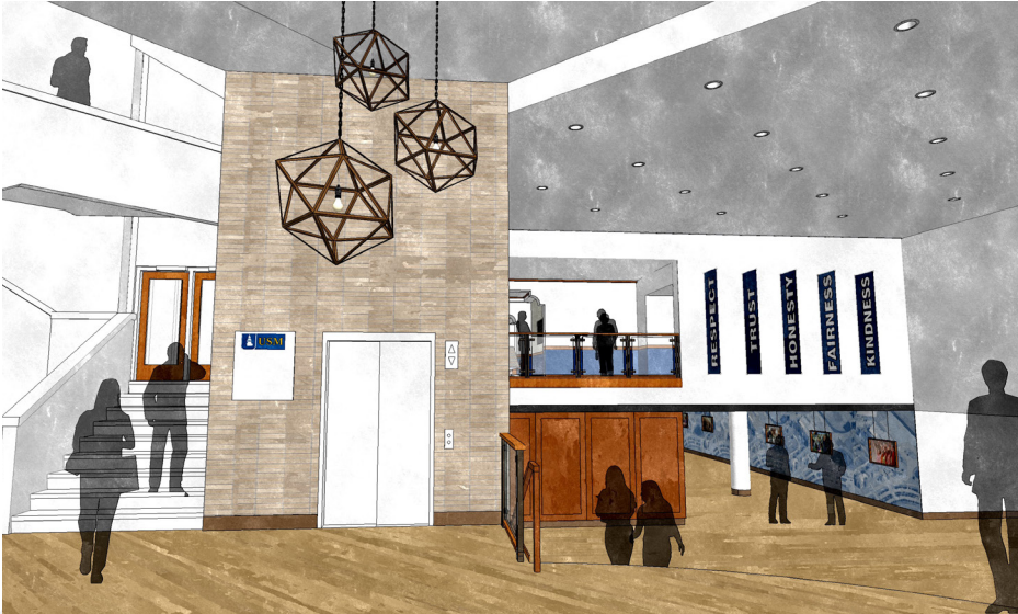
A rendering of the Hauske Family Lobby.

the naming of the Hauske Family Lobby in the Upper School. The new space connects the Jack Olson '67 Commons with the new servery, Palermo Hall. It also houses the new office for the Upper School dean of students and a new elevator, and will be one of the first spaces the students enjoy at the start of their school day.