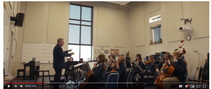
Stratton Family Orchestra Room and Sardas-Trevorrow Band Room www.USMOurCommonBond.org/stratton-sardas-trevorrow