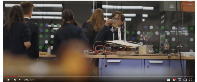
Lubar Center for Innovation and Exploration www.USMOurCommonBond.org/lubarcenter