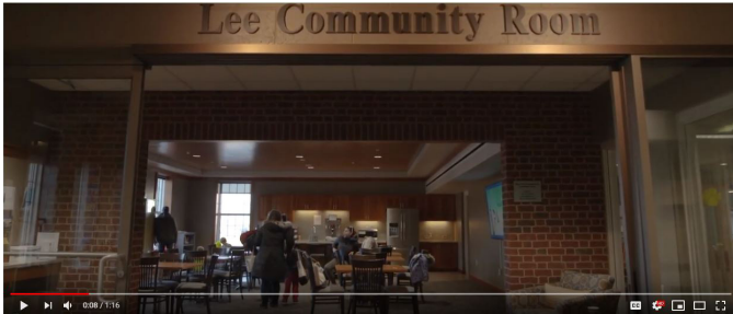
Lee Community Room and Darrow Family Welcome Center www.USMOurCommonBond.org/lee-darrow

We invite you to enjoy these brief videos of our students as they thank our many donors who helped make these spaces—and the programming they allow for—possible. All videos are also available to view by visiting www.USMOurCommonBond.org and clicking on the News section and then the Videos filter.