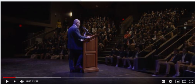
Virginia Henes Young Theatre expansion www.USMOurCommonBond.org/VHYtheatre